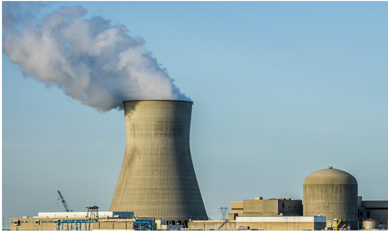
Nuclear Power plant