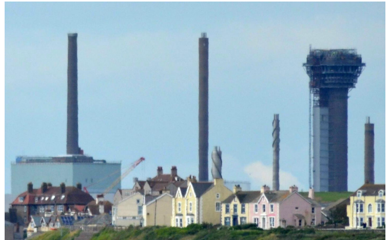
Nuclear Reprocessing plant

The Kurz Nuclear Obsolescence Assessment (NOA) program reviews the integrity of nuclear equipment 15 years and older for modifications or upgrades. The NOA program supports preventative maintenance activities, including identifying potentially high failure equipment, determining spare parts availability and inventory, and optimizing maintenance intervals.